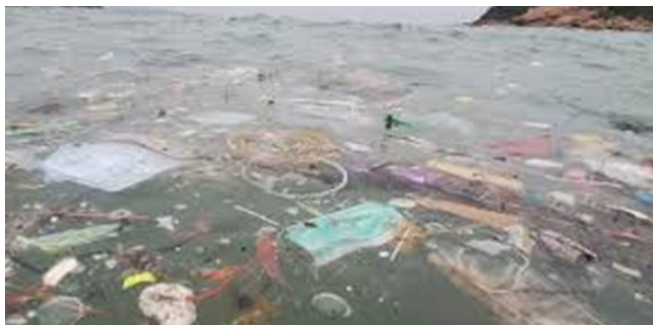
Environmentalists such as Stokes fear discarded masks and gloves will add to the ongoing fight against plastic pollution in the sea

Reference: https://www.dw.com/en/coronavirus-plastic-waste-polluting-the-environment/a-53216807